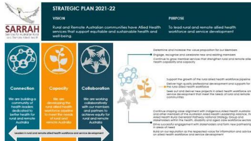
Strategic Plan 2022-25